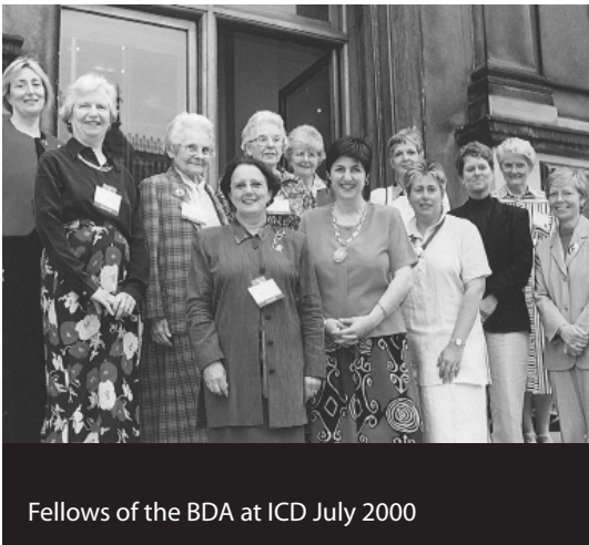
Fellows of the BDA at ICD July 2000

In 1947 the BDA became a limited company and the Articles of Association drawn up at the time represented the Constitution of the BDA, describing in legal terms how the Association must be governed. Changes have been made to the Articles, as the Association has grown and the membership's needs changed. Until the most recent reorganisation in 2009 the main functional body was the BDA Council, supported by a number of standing committees. In 1986 the BDA Council consisted of the Chairman and Secretary of the Association; the Chairman of each of the standing committees (Finance, Programmes, Education, Publications and Public Relations, Industrial Relations, Awards, and the newly constituted Research Committee); a representative from each of the BDA Branches; representation from the Specialist Groups; the editors of the three BDA publications (the monthly Newsletter, Adviser and Human Nutrition: Applied Nutrition, now the Journal of Human Nutrition and Dietetics), as well as four ordinary members. As there were 11 branches, it can be seen that this was a fairly unwieldy governing body with upwards of 30 members; it was also expensive to maintain. Council meetings regularly spanned two days necessitating overnight accommodation as well as travel expenses for some Council members, but it was not until the first full-functional reorganisation in 2000 that these issues were addressed.