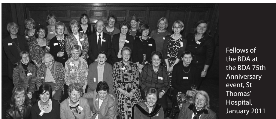
Fellows of the BDA at the BDA 75th Anniversary event, St Thomas' Hospital, January 2011

To January 2011, 79 Fellowships have been awarded, 40 of these since 1986. (A full list is provided in Appendix 3.)