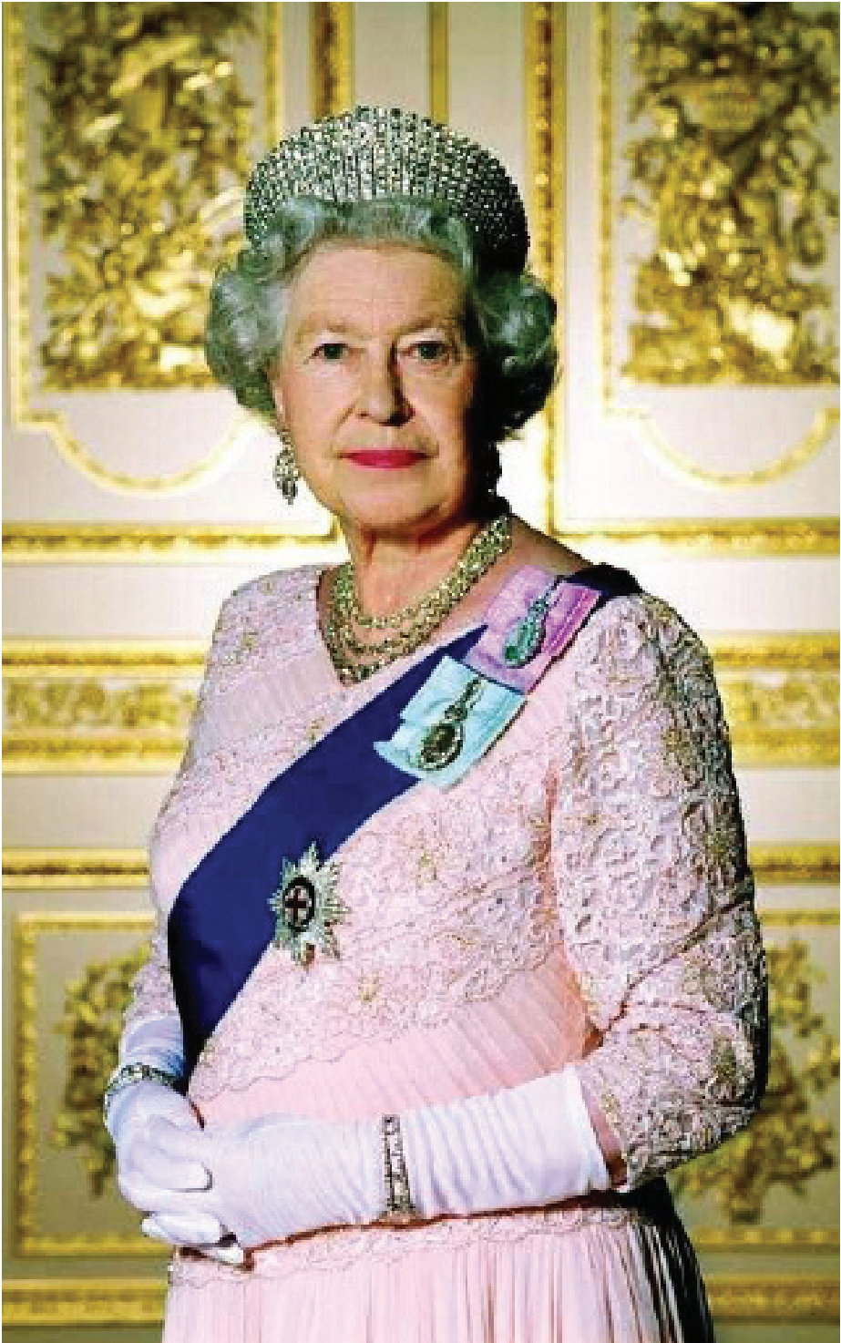
Her Majesty The Queen: Patron of the Association