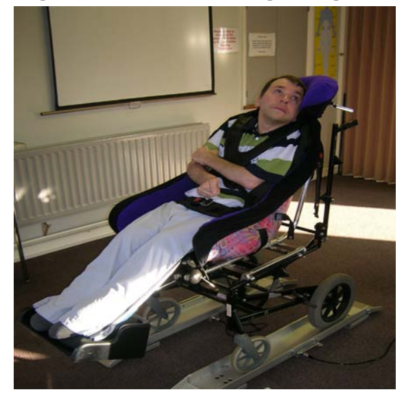
Figure 3. Client being weighed using wheelchair beam scales

Record if footplates, tray, headrest have been included in wheelchair weight and remove any bags from chair prior to weighing. This weight is then valid for subsequent weight checks, providing every aspect of the chair remains the same. Any alterations to the chair will need to be documented and require a new assessment of weight as changes invalidate previous assessments.