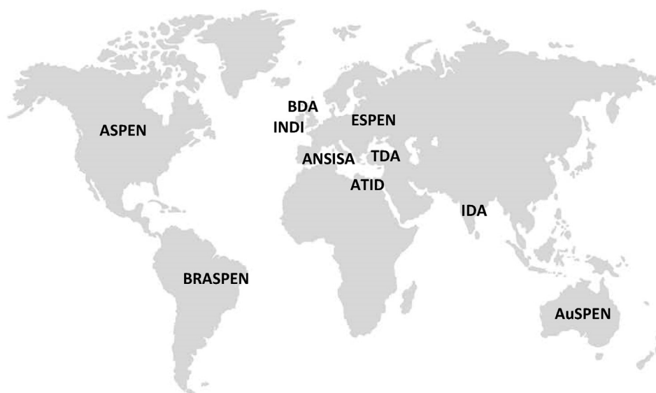
Fig. 2. Geographical location of guideline development. ASPEN: American Society for Parenteral and Enteral Nutrition; AuSPEN: Australasian Society for Parenteral and Enteral Nutrition; BRASPEN: Brazilian Society of Parenteral and Enteral Nutrition; BDA: British Dietetic Association; ESPEN: European Society for Clinical Nutrition and Metabolism; IDA: Indian Dietetic Association; INDI: Irish Nutrition and Dietetic Institute; ATID: Israeli Dietetic Association; ANSISA: National Association of Specialists in Food Science (Italy); TDA: Turkish Dietetic Association.